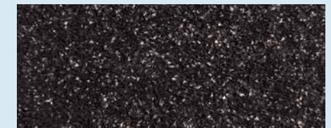
PAVIGYM BLACK TURF