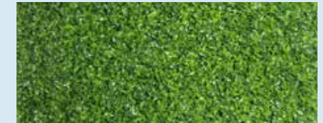
PAVIGYM GREEN TURF

*The appearance and color of these images may differ slightly from the final product.