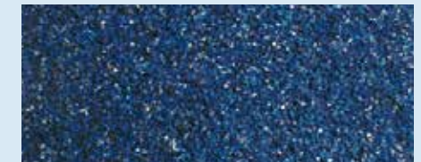
PAVIGYM BLUE TURF