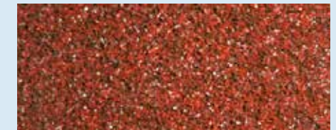
PAVIGYM BRICK TURF